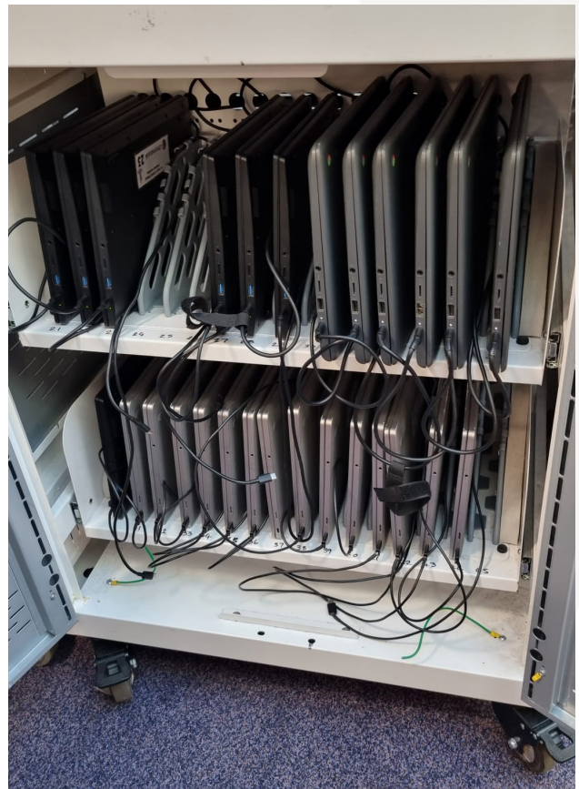
A PLUGIN MOBILE COMPUTER CABINET