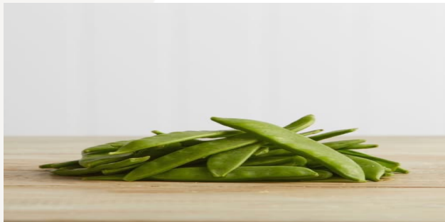
MTOUT AND SUGAR SNAP

SFA has a bigger vision for 2024 onwards. It intends to support the farmers to engage in permaculture. SFA will demonstrate this by venturing into the plantation of a variety of food crops including maize, cassava, Mtout and Sugar snap, Fine Beans, Ginger, and Spring Onions. SFA will also start snail farming and goat rearing. It will plant 1000 palm trees to add to a similar quantity planted in 2022. When matured, the palm kernels harvested will be made available to SFC women farmers to produce palm oil which will earn them additional income.