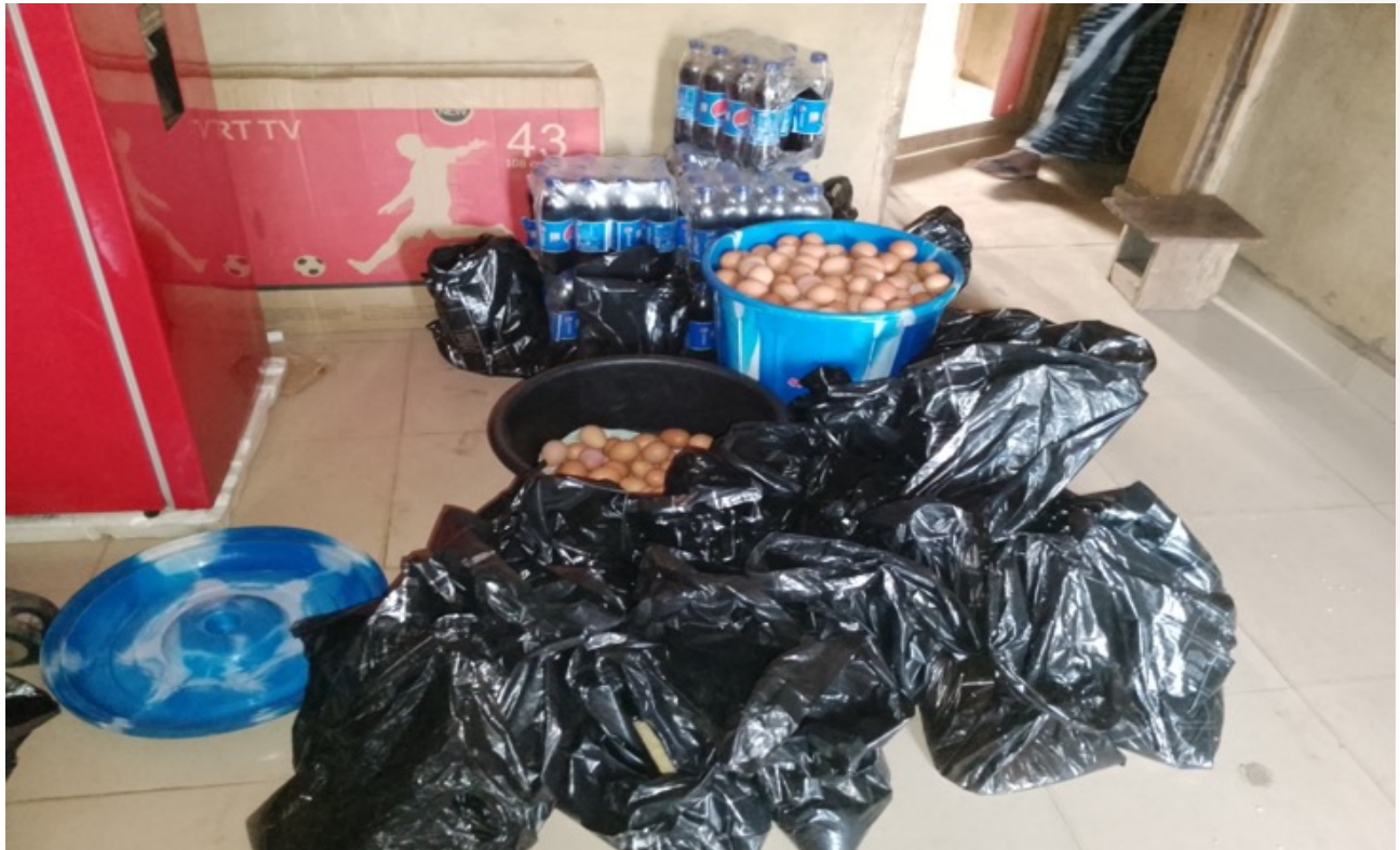
CHRIST HAMPERS FOR SFM YOUTH FOOD ITEMS IN THE HAMPERS