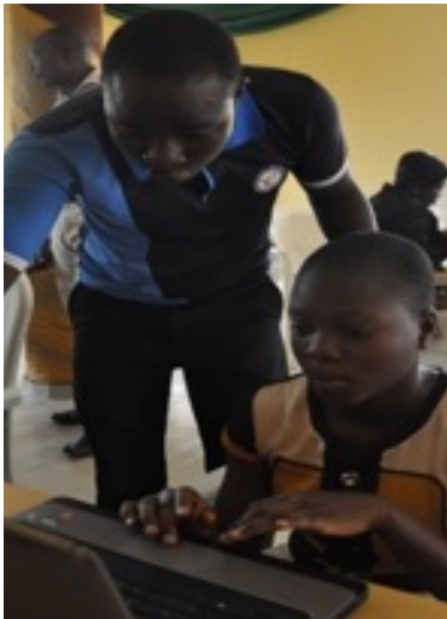
COMPUTER TRAINING SESSION

SFM would like to thank 15 donors who have pledged £1000 towards the construction of DILAC. You can partner with SFM by emailing us about your pledge via admin@shepherdsfood.org.uk