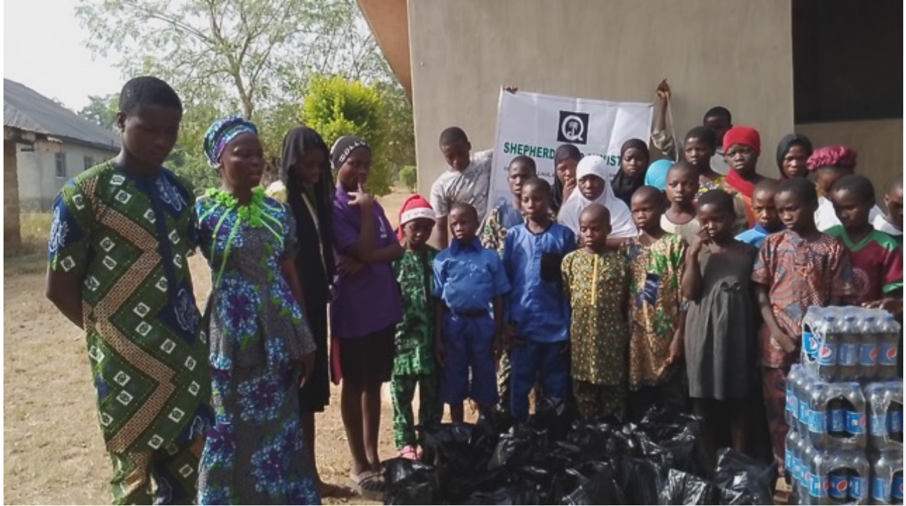
SFM YOUTHS GATHER FOR A GROUP PICTURE WITH THE HAMPERS

SFM SFM distributes Christmas hampers to SFM Youths during the festive period to alleviate hunger due to hikes in food prices and put smiles on their faces. SFM Youths in Kuta said they always look forward to this period because the hamper includes food items that they rarely eat including eggs, indomie, rice, fizzy drinks.