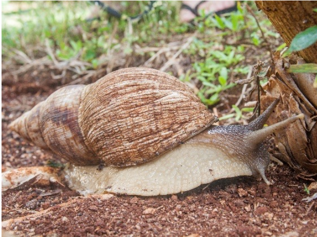
AFRICAN GIANT SNAIL