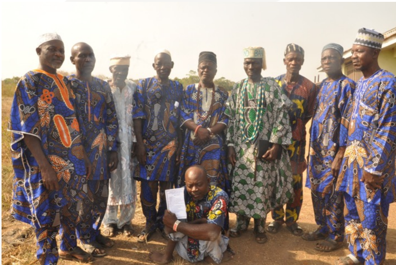
SFC MEN MEMBERS