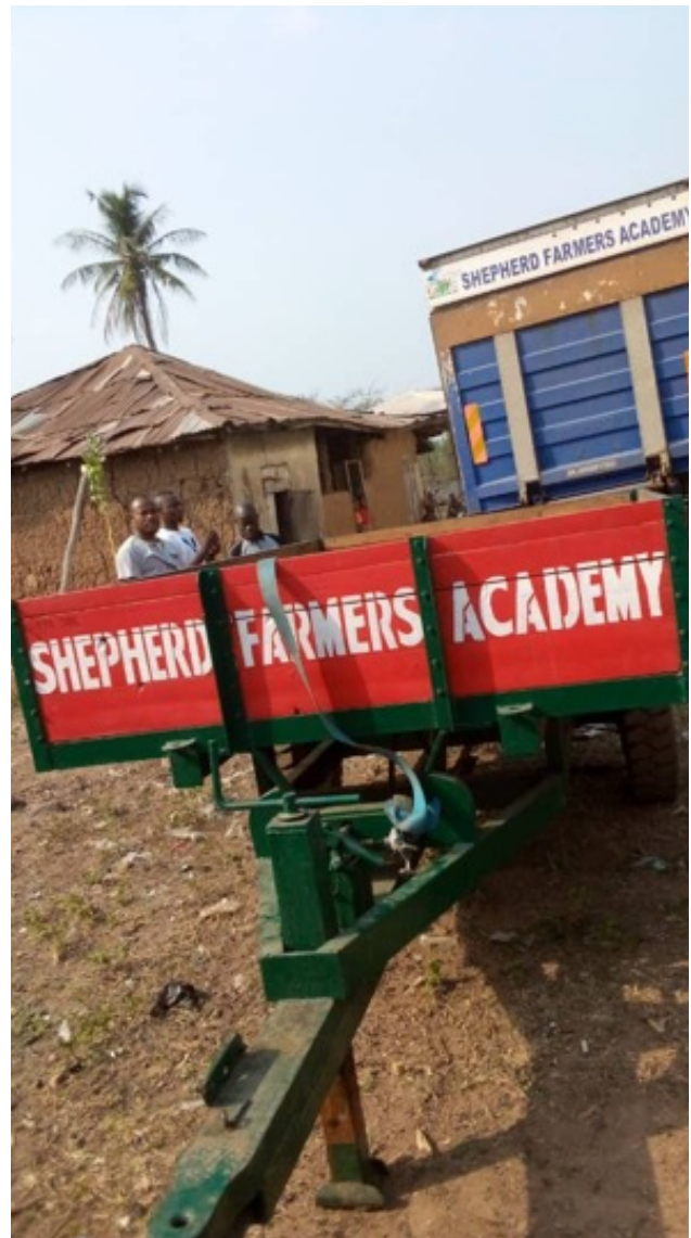
TRAILER AND COOLING TRUCK