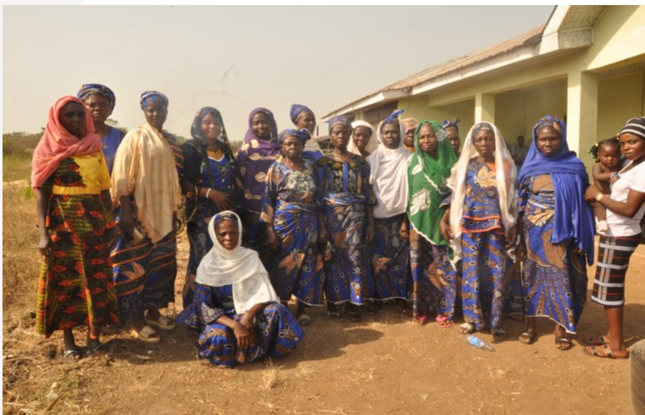
SFC WOMEN MEMBERS