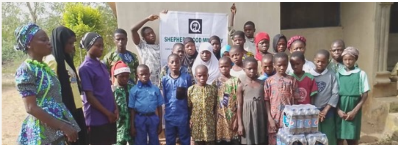
SFM YOUTHS AND THEIR COORDINATOR