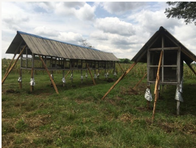
MAIZE CRIPS FOR WIND DRYING

SFM also appreciates donors who have been supporting SFM's training project for smallholder farmers to reduce postharvest loss and to enhance their livelihoods. These farmers now have access to SFM cassava processing facility and maize cribs/sheller to add value to their farm produce. Farmers do not need to sell their cassava at a loss because they can process it into Gari (flakes) which can be kept for a few years if there is a market glut. They can also use preservation bags to store their maize for longer. SFM is now expanding its demonstration farm to include cash crops i.e. palm tree plantation and palm oil processing. The women farmers are particular interested in palm oil processing which they have been doing using the traditional method. However, SFM intends to mechanise the process to increase productivity. SFM will also demonstrate to farmers best farming practices in vegetable farming and preservation. We would like to thank all our donors for your continuing support. Please email SFM if you are interested in becoming a regular donor.