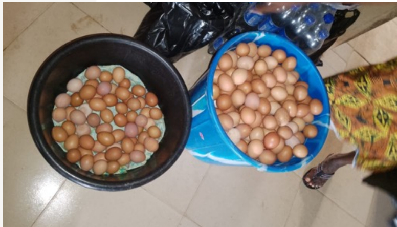
EGGS FOR CAKE BAKING

The talk on personal hygiene revolves around general selfcare, toilets, bathrooms and kitchens etiquettes, regular washing of cloths and cutting of fingernails and balanced diet. During the discussion, it was noticed that there is pad poverty among the young girls who have started their menstruation. SFM has decided to buy some boxes of pads to meet this need.